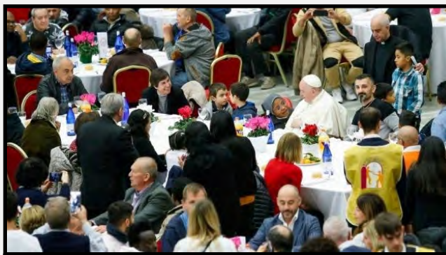
Pope Francis at lunch on World Day of the Poor 2022.

“Do not turn your face away from anyone who is poor” (Tob 4:7). These words help us to understand the essence of our witness. By reflecting on the text of the Old Testament, yet wisdom, we can better appreciate what the sacred writer wished to communicate. We find in the Book of Tobit, a little-known one that is charming and full of wisdom, we can better appreciate what the sacred writer wished to communicate. We find in the Book of Tobit, a little-known one that is charming and full of wisdom, we can better appreciate what the sacred writer wished to communicate. We find in the Book of Tobit, a little-known one that is charming and full of wisdom, we can better appreciate what the sacred writer wished to communicate.